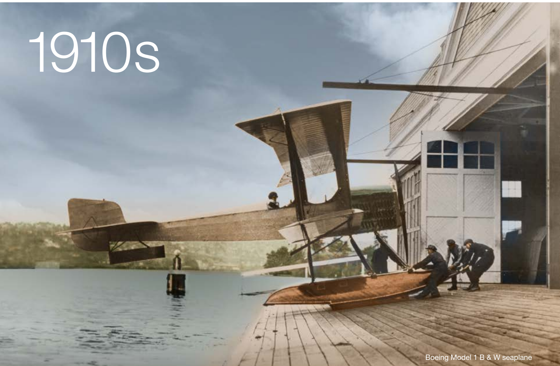
Boeing Model 1 B & W seaplane