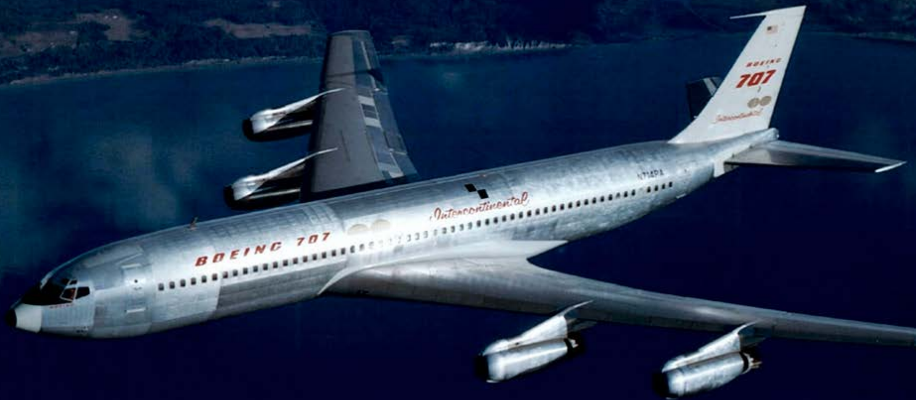
Boeing 707 jetliner