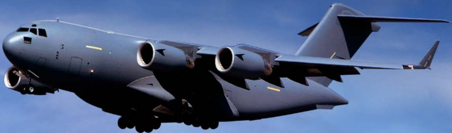
Boeing C-17 Globemaster III transport