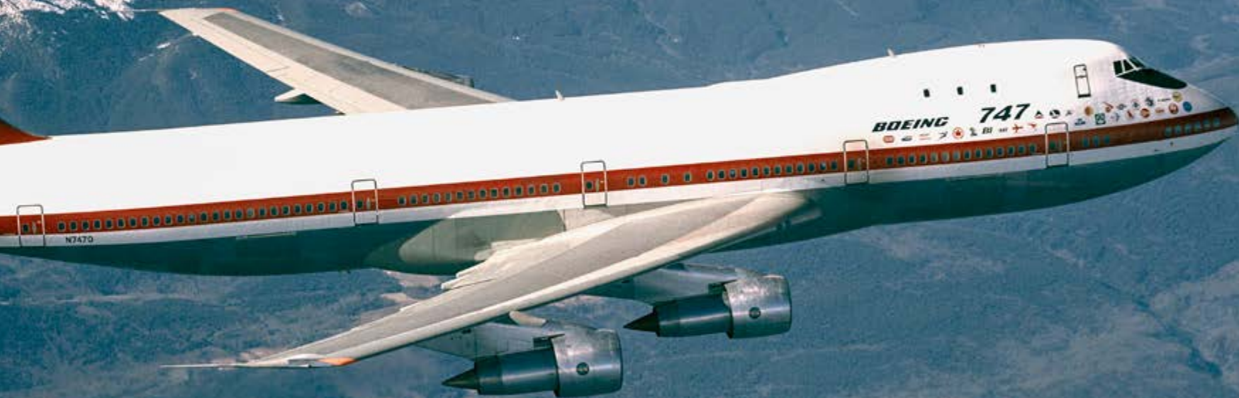
Boeing 747 jetliner