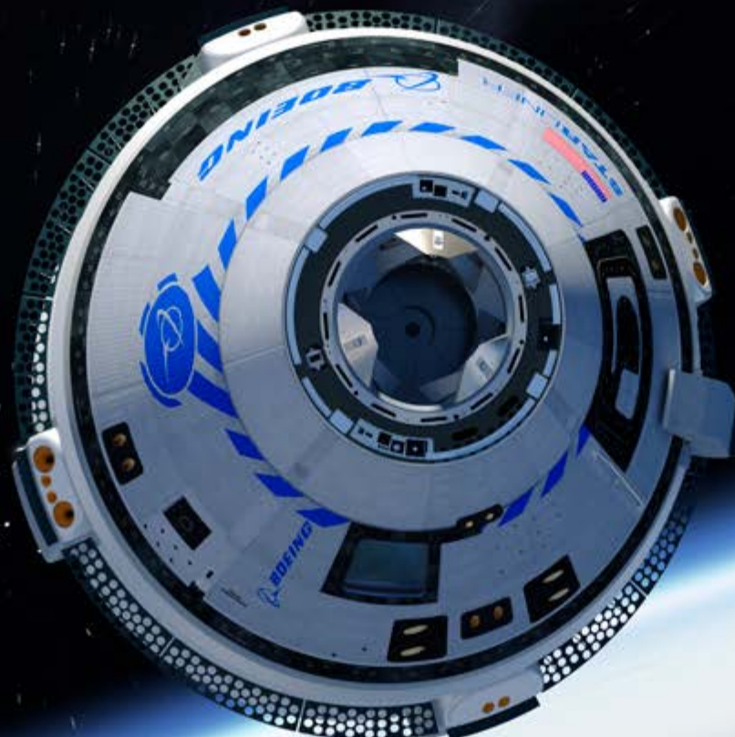
Boeing CST-100 Starliner