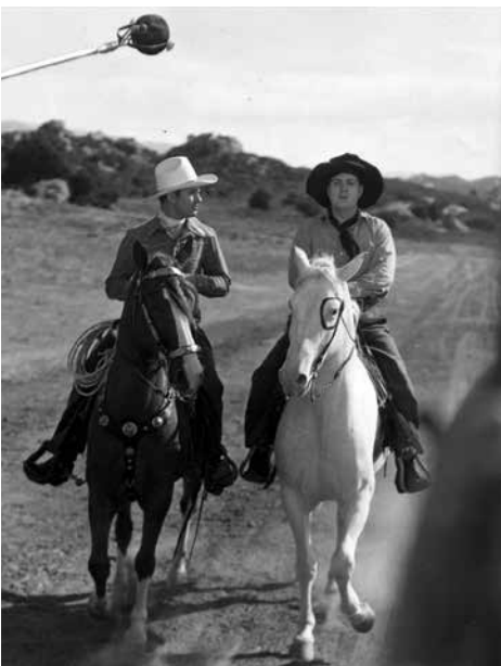
Gene Autry in Rovin' Tumbleweeds (Republic Films, 1939).

The rugged open terrain and majestic rock formations interspersed with sculpted oak trees made the area a natural choice for country living. It was also a picturesque setting for motion pictures. RKO and Republic Pictures approached Henry Silvernale about using his property for movies and television shows and they entered into a filming agreement.