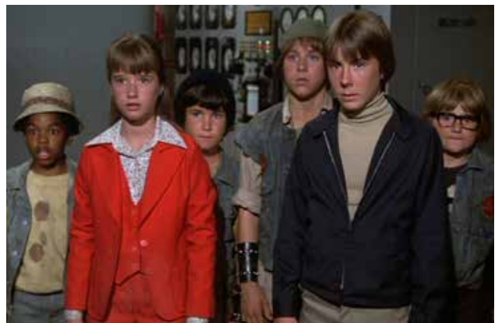
Return from Witch Mountain (Disney, 1978) starred Bette Davis and Christopher Lee.

the nation, and that includes its ranching and movie history. After all, engines – from the short-range post-World War II Redstone to the huge Saturn-V that took man to the moon – were tested at a place once known as Sky Valley Ranch.