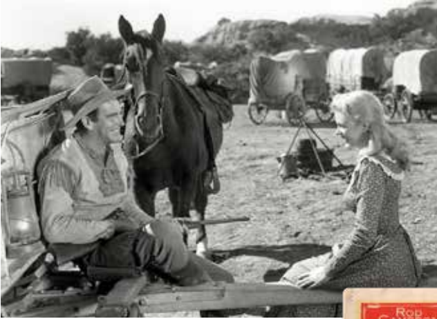
Rod Cameron and Anita Louise in Wagons West (Republic, 1940).