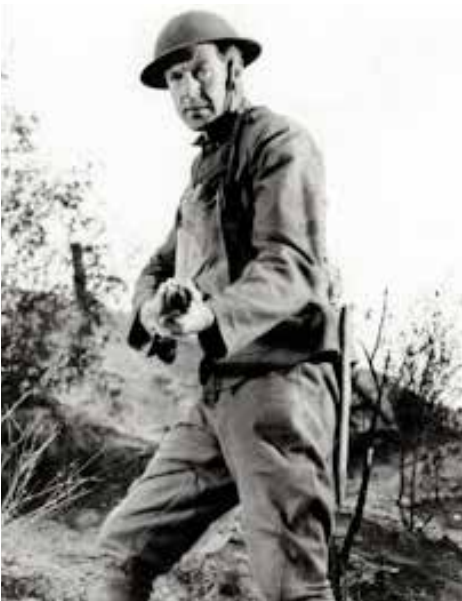
Gary Cooper is pictured here in Sergeant York (Warner Bros, 1941), which was the highest grossing box office film of the year.