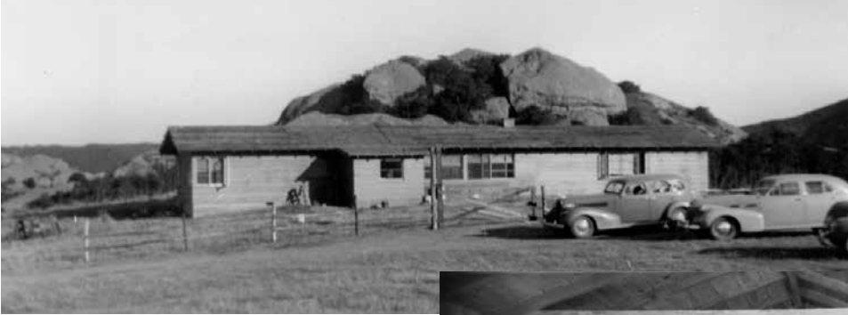
The Silvernale Family established Sky Valley Ranch at Burro Flats in 1939.

During its 15-year existence, some of the land at Sky Valley Ranch was dry-farmed, which meant crops were cultivated without irrigation. The other areas of the ranch were used for raising cattle.