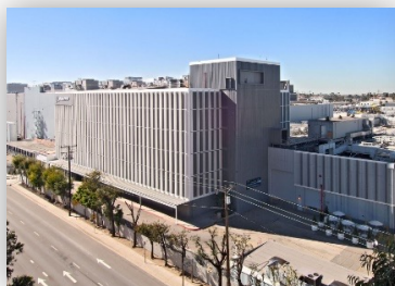
Exterior of Boeing Satellite Factory

Boeing's satellite systems business is located in El Segundo, Calif. The world's first geosynchronous communications satellite, Syncom, was built there by Boeing and launched in 1963. Since then, Boeing has delivered more than 300 satellites to more than 50 customers in more than 20 countries, and continues to design and build government and commercial satellites in its factory in El Segundo.