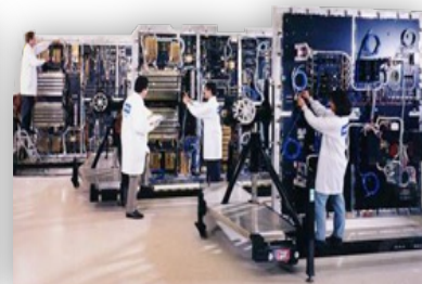
Payload Integration & Test