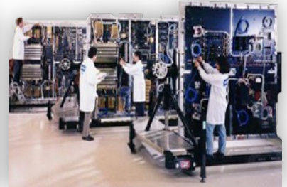
Payload Integration & Test