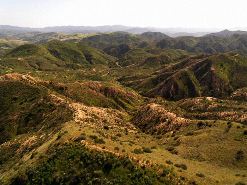
Aerial photo of the Simi Hills.