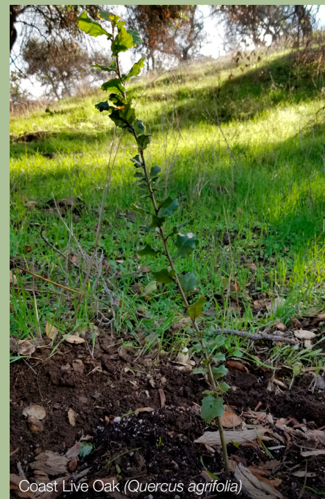
Coast Live Oak ( Quercus agrifolia )

The Southwestern Herpetologists Society had a record snake identification day in early April when they identified 16 snakes in one day, including 11 Gopher snakes, three California King snakes, one Ringed-neck snake and one Two-striped garter snake. Also ID'd that same day: Side-blotched lizards, Western fence lizards, Western skinks, Baja California tree frogs, Western toad tadpoles and numerous invertebrates, including a young tarantula spider. Visit https://swhs.org/ for more information.