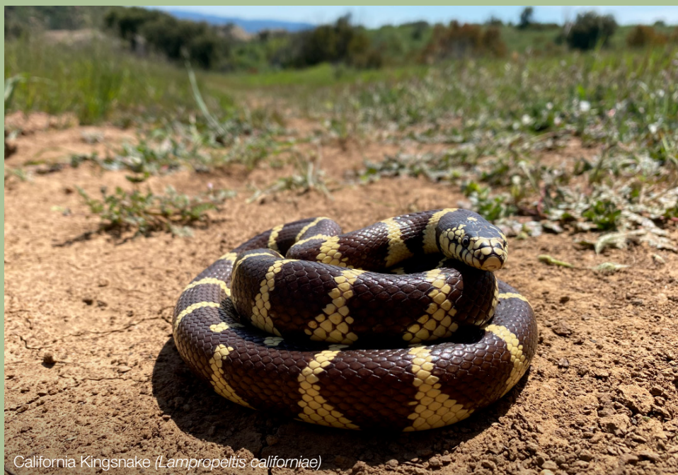
California Kingsnake ( Lampropeltis californicae )

For more information, visit https://simihillswildlife.wixsite.com/aboutus .