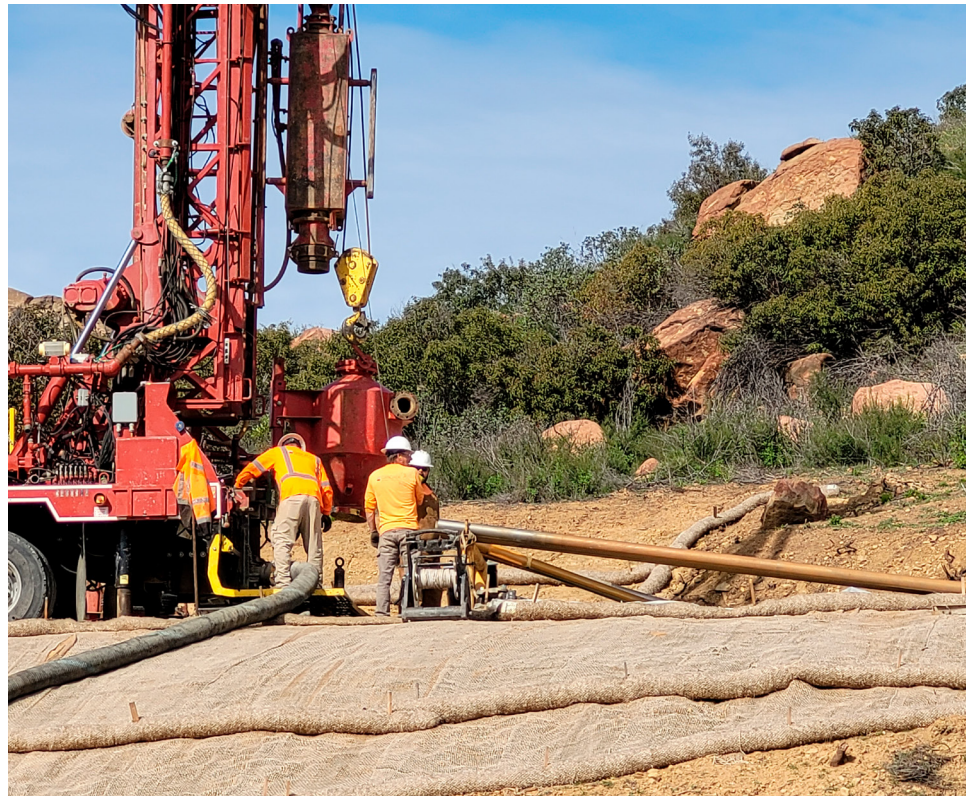
Crew installs bedrock vapor extraction well near the former Component Test Laboratory III.

Onsite, the vacuum will be applied to extraction wells open to fractures and unsaturated porous bedrock and will focus in an area where high levels of TCE were found in partially saturated rock and groundwater. This field work will be conducted in collaboration with the University of Guelph Morwick G360 Groundwater Research Institute, groundwater experts who have studied the site for more than 25 years.