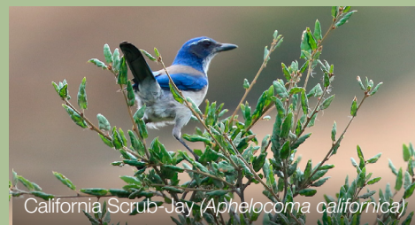
California Scrub-Jay ( Aphelocoma californica )

In celebration of Earth Day, Boeing and citizen scientists from the Sky Valley Volunteers, Simi Hills Wildlife Observatory and Southwestern Herpetologists Society hosted a private nature walk, highlighting the citizen scientists' onsite biological activities.