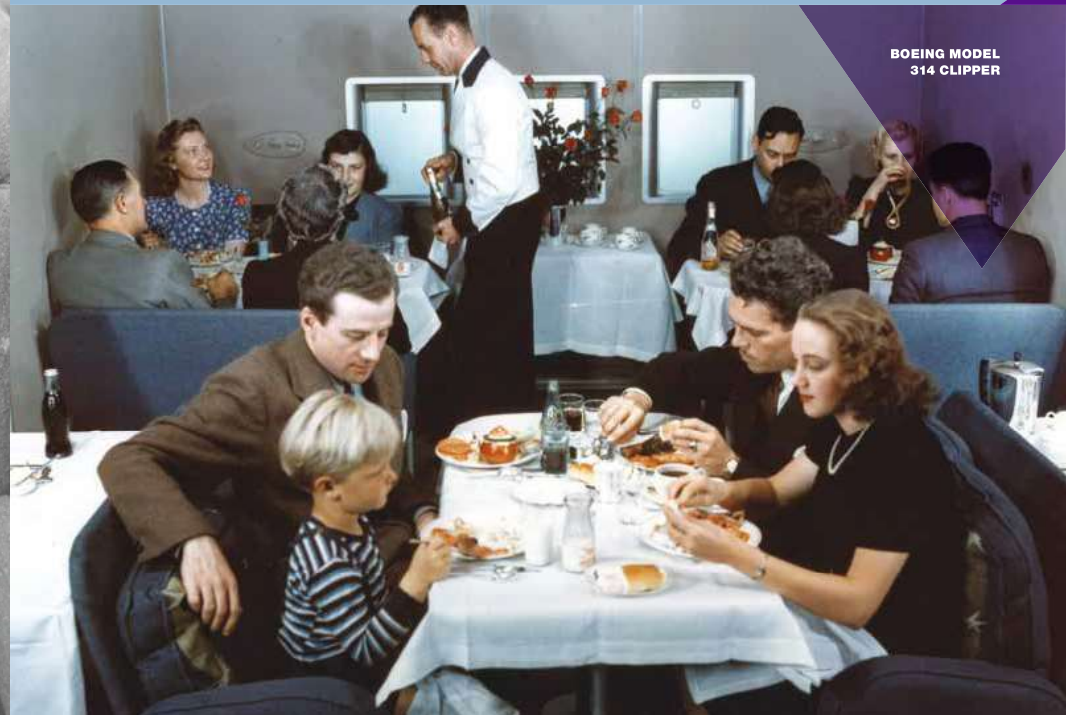
BOEING MODEL 314 CLIPPER