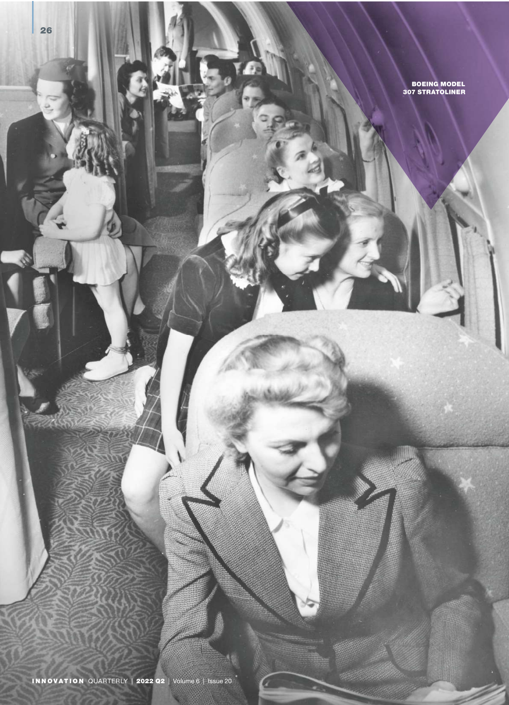
BOEING MODEL 307 STRATOLINER

The next major advancement in the passenger experience came with more powerful airplanes that could fly at higher altitudes. The Boeing Model 307 Stratoliner was the world's first high-altitude commercial transport and the first four-engine airliner in scheduled domestic service.