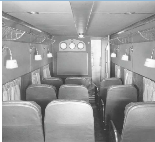
BOEING MODEL 80