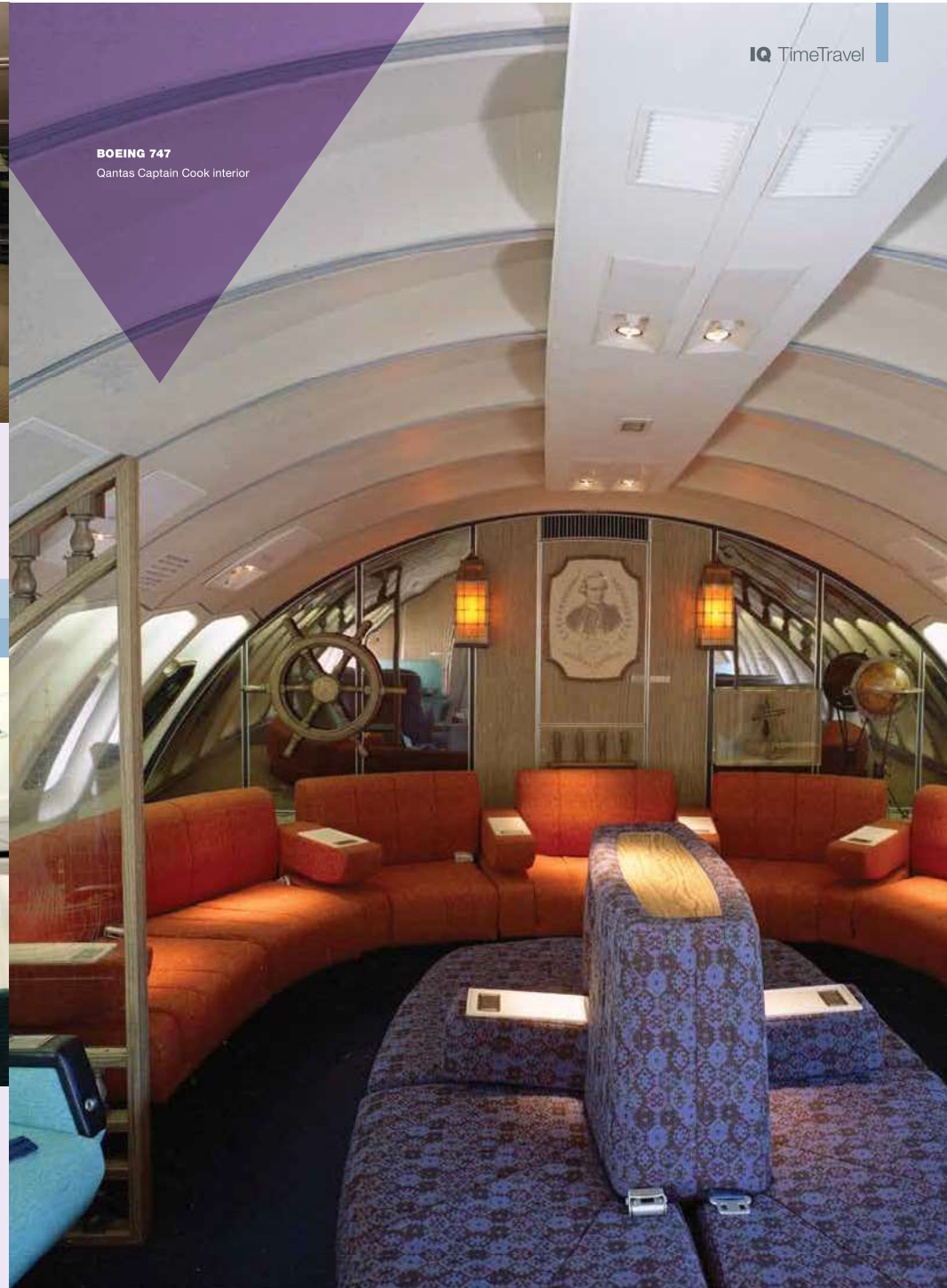
BOEING 747 Qantas Captain Cook interior

On the 747, overhead bins replaced the conventional hat rack-style storage, securing luggage in case of turbulence.