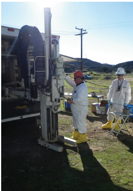
Figure 2: Workers conducting subsurface soil sampling in Area IV with a direct push drill rig

Throughout Area IV and the Northern Buffer Zone, a total of 3,735 surface and subsurface soil samples were collected and analyzed for radioactive contaminants. The analytical results were compared to the background levels in accordance with the AOC.